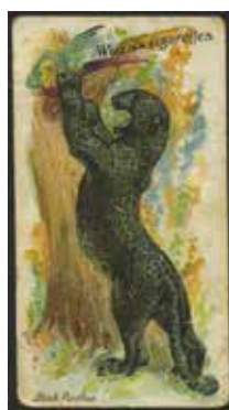
EX LOT 195 70% OF ACTUAL SIZE