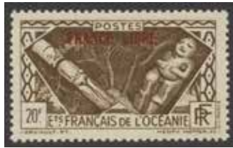
EX LOT 1832