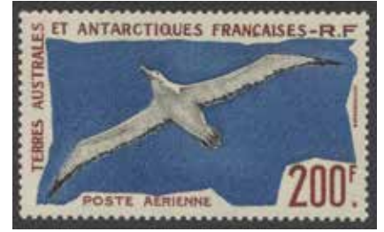
EX LOT 1831