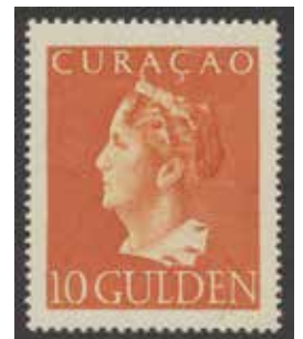
EX LOT 1949