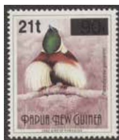
EX LOT 1999